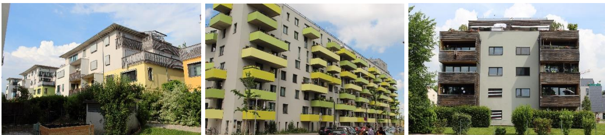
“Passive House for all” is the theme for the 21 st International Passive House Conference next year. Passive House buildings in Vienna: (f.l.) Building Esslinger Straße, Building SoWieSo, Building Mühlweg.